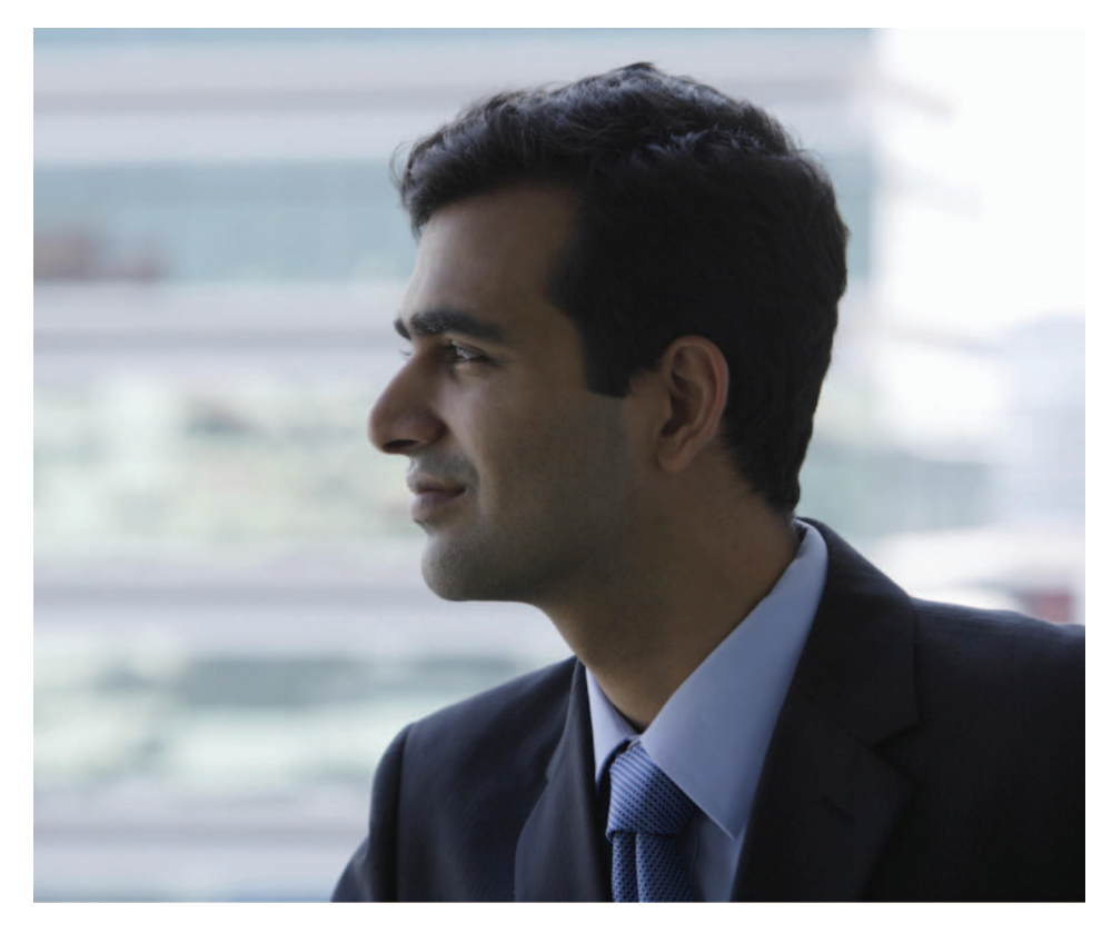
long gone thanks to social media. More personally, his concerns mean spending more time thrashing the issues out, which means more time away from home, and the dream of having a family.

The days when your business could claim to be an upstanding citizen in one market and expect to be able to turn a blind eye in another are